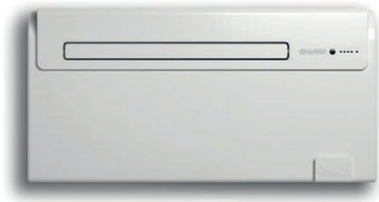
Design by Sara Ferrari

Unico AIR Inverter® is the winner of GOOD DESIGN AWARD 2016. Founded in Chicago in 1950, GOOD DESIGN is the oldest internationally recognized competition for design excellence.